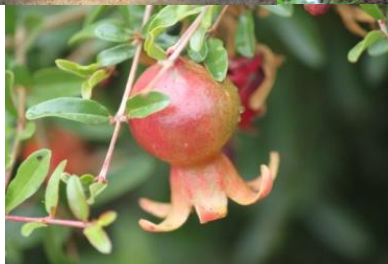
Dwarf Pomegranate fruit